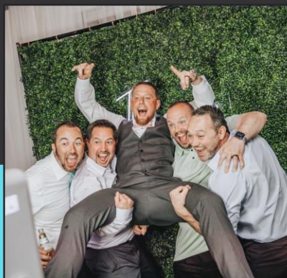
PHOTO & VIDEO BOOTHS

Capture memories your way! Several photo & 360 booth options are available including 360 video, The Socialite Booth, and the Glam Booth.